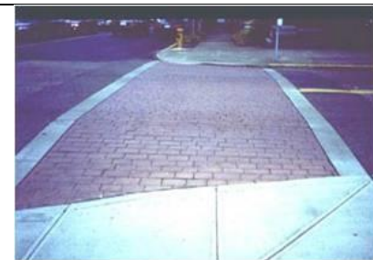
Figure 16 - Textured Crosswalk, Portland, OR

Textured Crosswalks incorporate a textured or patterned surface which contrasts with the adjacent roadway. It helps to better delineate the crossing locations and helps reduce pedestrian-vehicular conflicts. This treatment may be used on both local and collector roadways. Textured crosswalks can be combined with curb extensions and/or raised median islands to further improve pedestrian safety. They should only be used at formal pedestrian crossing locations with painted crosswalk pavement markings such as those found at signalized or stop controlled intersections.