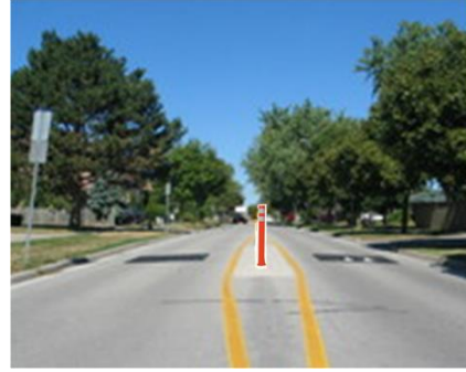
Figure 1 - Speed Cushions with Mountable Centre Median 8 , Oakville, ON

Speed Cushions are small speed humps designed to slow passenger vehicles but are typically designed so that the wheel base of emergency vehicles straddle the speed cushion. The wider wheelbase on emergency vehicles allows them to pass over the speed cushion without slowing down. Speed cushions can be sized and designed in sets of 2-3 cushions (one in the middle and one on each side). Another technique is to use a mountable centre island design with a 'knock-down' post in the middle (shown in picture below). The separation between speed cushions is designed with enough space for emergency vehicles to avoid touching the speed cushions and thus not having to slow down. Speed cushions may be used on local and collector roadways with design modifications tailored to suit individual roadway dimensions to ensure smooth passage for emergency and transit vehicles.