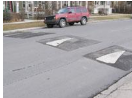
Figure 3 - Speed Cushions for Emergency Vehicles 10