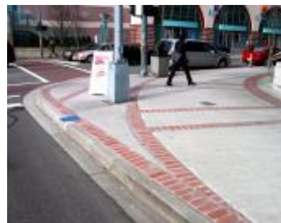
Figure 6 - Curb Radius Reduction

Curb radius reduction is the reconstruction of an intersection corner to a smaller radius. This measure effectively slows down right-turning vehicle speeds by making the corner 'tighter' with a smaller radius. A corner radius reduction may also improve pedestrian safety to a certain degree by shortening the crossing distance. This type of measure is acceptable on local and collector roadways, but its use is often limited to specific situations where the existing intersection geometry would allow the reconstruction. In addition, curb radius reductions should not be used on transit routes requiring a right turn.