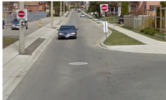
Figure 11 - Directional Closure, Kitchener, ON

Directional closures are created using a curb extension or other barrier that extends into the roadway, approximately as far as the centerline. This device obstructs one side of the roadway and effectively prohibits vehicles travelling in that direction from entering. Directional closures are especially useful for controlling non-compliance of one-way road sections and are compatible with other modes such as bicycles. At all directional closures, bicycles are permitted to travel in both directions through the unobstructed side of the road; however, some directional closures have a pathway built through the device specifically for bicycles. Since their purpose is to prevent short-cutting traffic, directional closures are applicable for use on local streets and minor collectors, at their intersection with collectors and arterials.