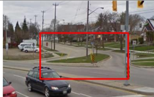
Figure 13 - Intersection Channelization and Right-in/Right-out Island, Kitchener, ON

Right-in/right-out islands are raised triangular islands located on an intersection approach to limit the side street to right turn in and out movements. Similar to a raised median through an intersection, this device is used primarily to restrict movements to and from an intersection roadway. Right-in/right out islands may be considered only for use in locations where local residential streets intersect another roadway of any class.