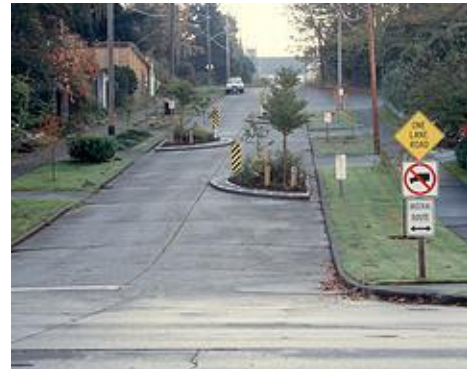
Figure 5 - One-Lane Chicane 12

A one-lane chicane is most applicable to the Town of Milton's application on local and minor collector roadways that are not designated transit or emergency routes.