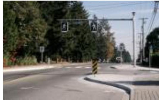
Figure 4 - Curb Extension

Curb extensions (intersection and/or mid-block) improve pedestrian safety by reducing the distance that pedestrians must travel to cross a roadway, by improving the visibility of pedestrians for approaching motorists, and the visibility of approaching vehicles for pedestrians. Curb extensions are sometimes referred to as bulb-outs or neck-downs. They can be used at intersections and at midblock locations, and can be used alone or in combination with a textured crosswalk and/or a median island. In addition to their pedestrian safety benefits, curb extensions on one or both sides of the roadway also help to reduce vehicle speeds. Curb extensions may be considered for use on both local and collector roadways, including transit and emergency response routes.