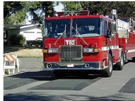
Figure 2 - Speed Cushions, Calgary, AB 9