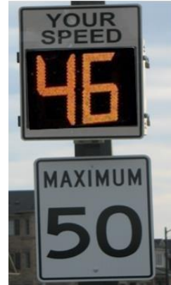
Figure 17 - Whaley Way, Milton, ON

Driver Feedback Boards are pole-mounted devices equipped with radar speed detectors and an LED display. The boards are capable of detecting the speed of an approaching vehicle and displaying it back to the driver. When combined with a regulatory speed limit sign, a clear message is sent to the driver displaying their vehicle speed. The objective of the program is to improve road safety by making drivers aware of their speed, evoking voluntary speed compliance.