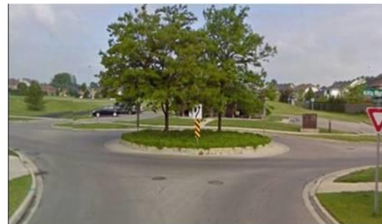
Figure 9 - Traffic Circle, Ancaster, ON

Traffic circles are a raised island located in the centre of an intersection designed to reduce vehicle speeds and reduce vehicle-vehicle conflicts. Intersection should have balanced traffic volumes. Traffic circles should not be used on major collector or arterial roadways, even where these roads intersect local residential streets. Experience in other communities has shown that, where traffic circles are located on more major roads that carry significantly higher traffic volume, traffic entering the traffic circle from the major road often fails to yield to traffic that has already entered from the local street, creating a safety concern. Traffic circles should not be confused with the modern roundabout which is typically larger with raised median islands at all approaches and it may serve two or more entry lanes of traffic.