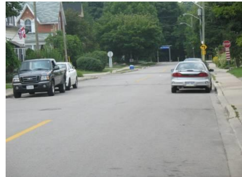
Figure 7 – On-street Parking on Both Sides, James St., Milton, ON

On-street parking is a practical way of decreasing the effective road width by allowing vehicles to park adjacent and parallel to the road edge. This type of measure is applicable on most local and collector roadways. The primary benefit of allowing on-street parking as a traffic calming measure is the reduction in vehicle speeds due to the narrowed travel space. This type of measure may prove to be effective for older residential neighbourhoods closer to the Town Centre. In newer Town subdivisions some roadways have a narrower design to accommodate parking on only one side (parking banned on opposite side). In this situation, changing the parking configuration to permit parking on both sides is not recommended.