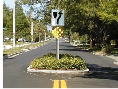
Figure 12 - Raised Median through Intersection, Kitchener, ON

Raised median through intersection. These devices may be used on the centerlines of local and collector roadways to prevent left-turn and through movements to and from intersecting streets. This type of device is especially effective at preventing short-cutting and through traffic while providing some secondary pedestrian safety benefits.