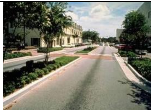
Figure 8 - Raised Median (with Textured Crosswalk) 13

Raised median islands are installed in the centre of a roadway to reduce the overall width of the travelled lanes. They help slow traffic without affecting the capacity of the road. Raised median islands can be combined with curb extensions and/or textured crosswalks to further improve pedestrian safety. This measure may be considered on both local and collector roadways.