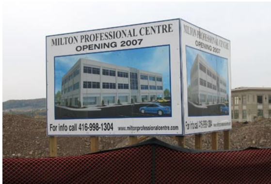
Site of the Milton Professional Centre at 410 Bronte Street

Maple Reinders Constructors Limited has commenced construction on the Milton Professional Centre, a new professional office complex at 410 Bronte Street. This project continues the development of professional offices already in the Bronte Street and Derry Road corridor, supporting Milton Hospital and professional services in Milton.