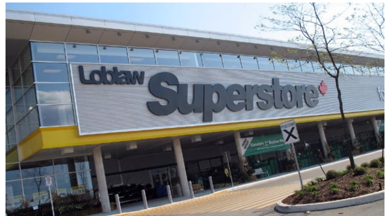
Loblaw Superstore at Main Street and Thompson Road

The new Milton Superstore will also be the first major grocery and general merchandise retail store in North America to eliminate traditional plastic grocery bags at the checkouts. In April of this year, Loblaw Companies Limited made a commitment to reduce one billion plastic grocery bags from Canada's landfills within one year by reducing the amount of plastic grocery bags offered in stores and offering more sustainable choices.