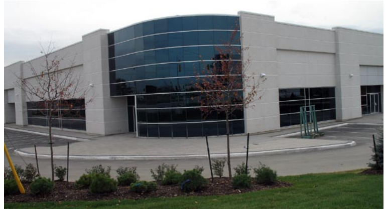
Multi-tenant industrial facility in the Escarpment Business Community